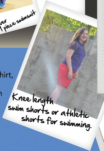
Knee length swim shorts or athletic shorts for swimming.