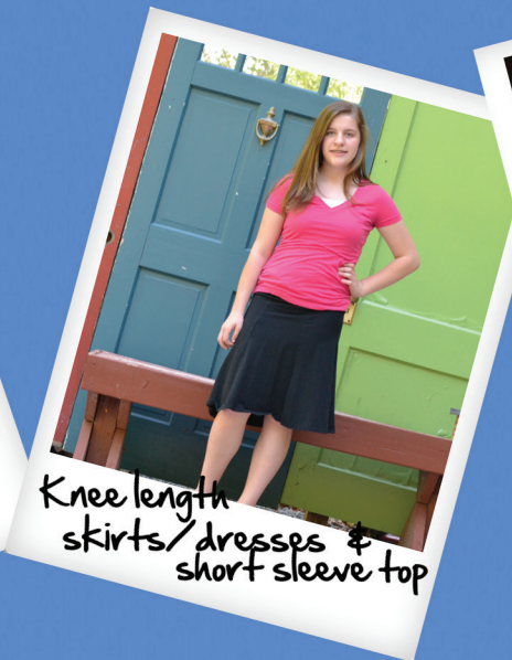
Knee length skirts/dresses & short sleeve top