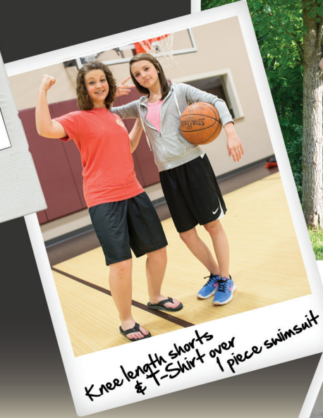
Knee length shorts & T-Shirt over 1 piece swimsuit