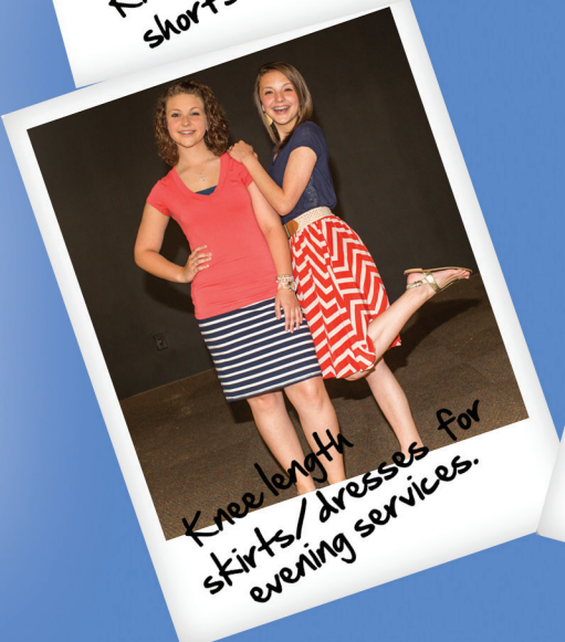
Knee length skirts/dresses for evening services.

Girls: Knee length or longer skirt or dress. Short sleeve top (no tank tops) Casual shoes Guys: Jeans or slacks, button down or polo