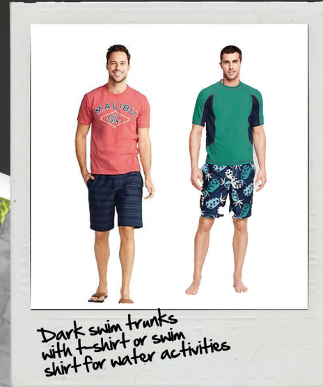
Dark swim trunks with t-shirt or swim shirt for water activities

Guys: Knee length shorts, T-shirt, casual shoes. Swim Shirt-shirt and dark swim trunks for swimming