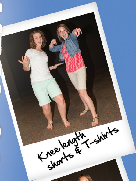
Knee length shorts & T-shirts