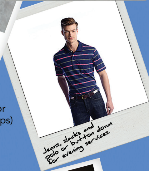
Jeans, slacks and polo or button down for evening services.