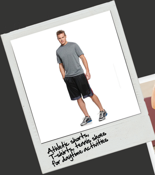
Athletic shorts, T-shirts, tennis shoes for daytime activities