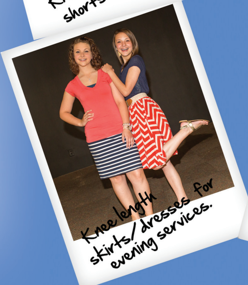
Knee length skirts/dresses for evening services.

Guys: Jeans or slacks, button down shirt or polo