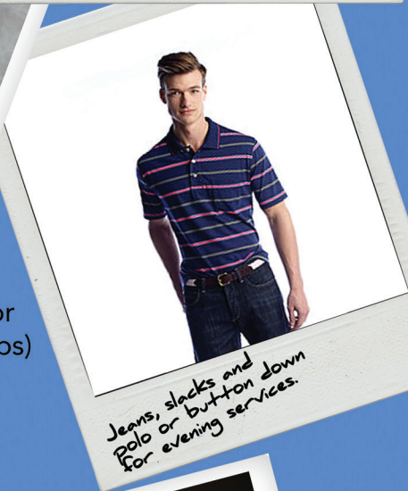
Jeans, slacks and polo or button down for evening services.