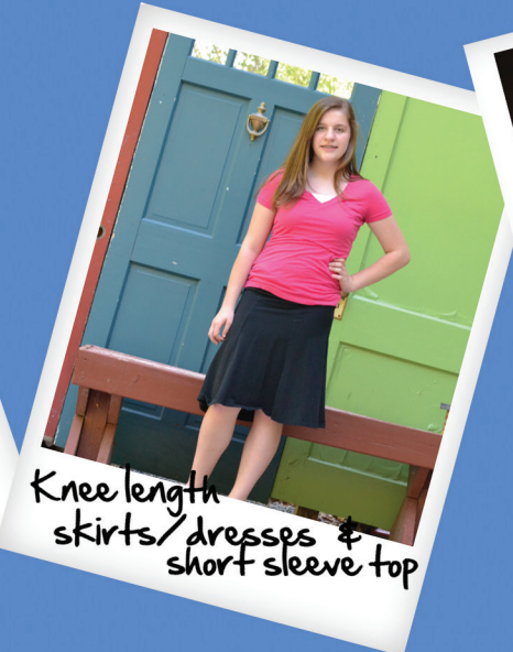
Knee length skirts/dresses & short sleeve top