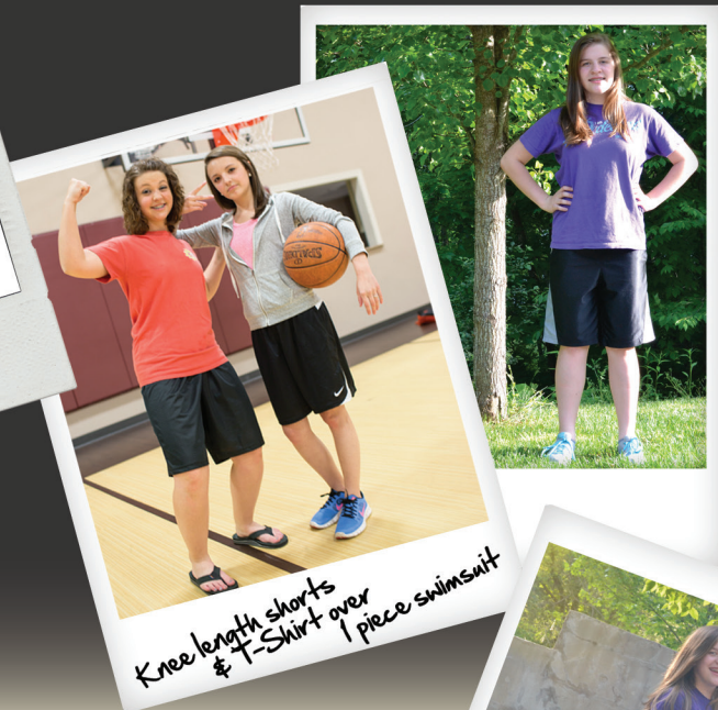
Knee length shorts & T-Shirt over 1 piece swimsuit