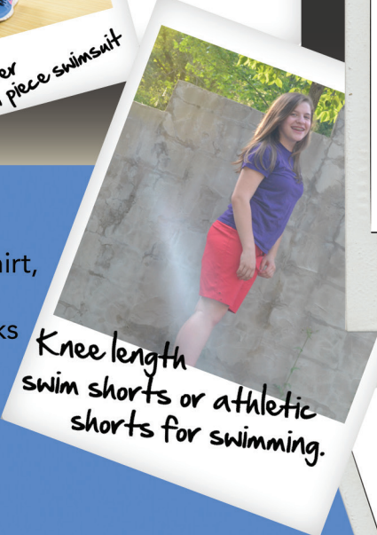
Knee length swim shorts or athletic shorts for swimming.