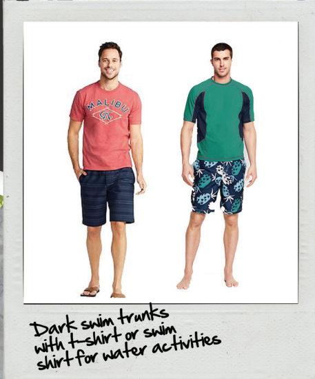
Dark swim trunks with t-shirt or swim shirt for water activities

Swim shirt and dark swim trunks for water activities