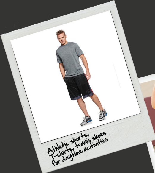
Athletic shorts, T-shirts, tennis shoes for daytime activities