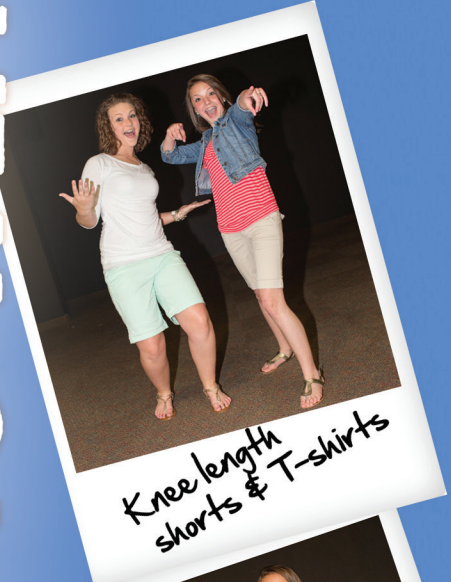
Knee length shorts & T-shirts